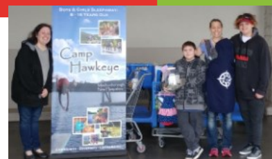
HCF FAMILY AND FRIENDS ACCEPTED DONATED SUPPLIES AND FUNDS AT HCF'S FIRST WALMART GIVING DAY